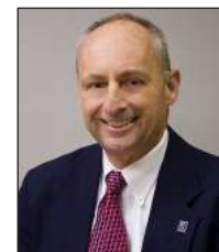
Dick Koestner Senator Chuck Grassley

In addition to regular contact with the assigned Member of Congress, there are several specific tasks that are required to fulfill the role of FPC.