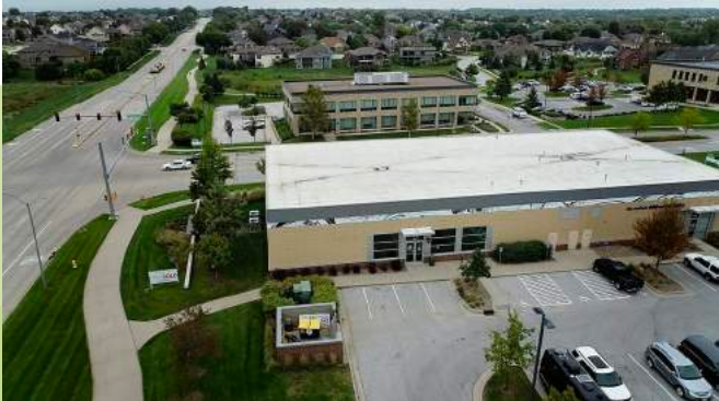
New IAR Office 5950 Village View Drive Suite 100 West Des Moines, IA 50266

In February, we will be moving into our new headquarters in West Des Moines. We are proud new owners! After 20 years of leasing our current space, we will be practicing what we preach. The new space will allow us to better serve our 7,500 members across the state. We will have state-of-the-art classrooms and meeting space.