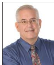
Les Sulgrove Congresswoman Cndy Axne