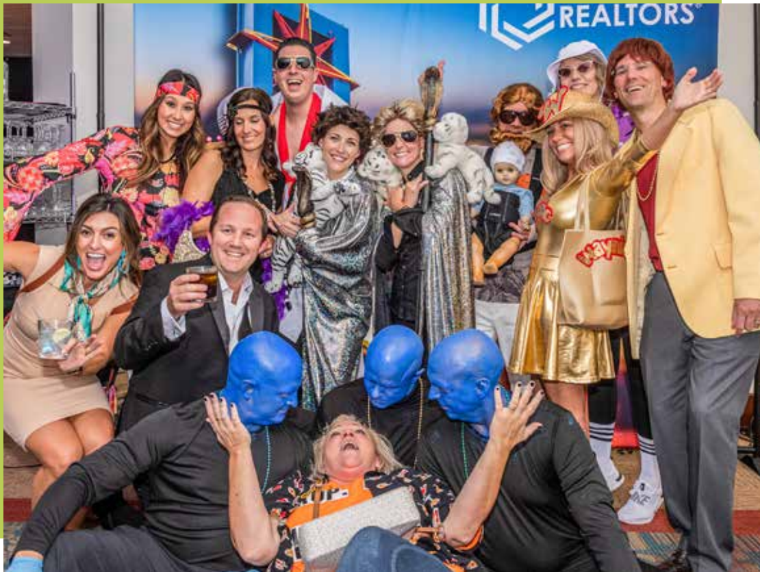
The Casino Fun Night brought many laughs at the Vegas costumes and characters. Attendees enjoyed winning big with their fun money and networking with REALTOR® friends from around the state