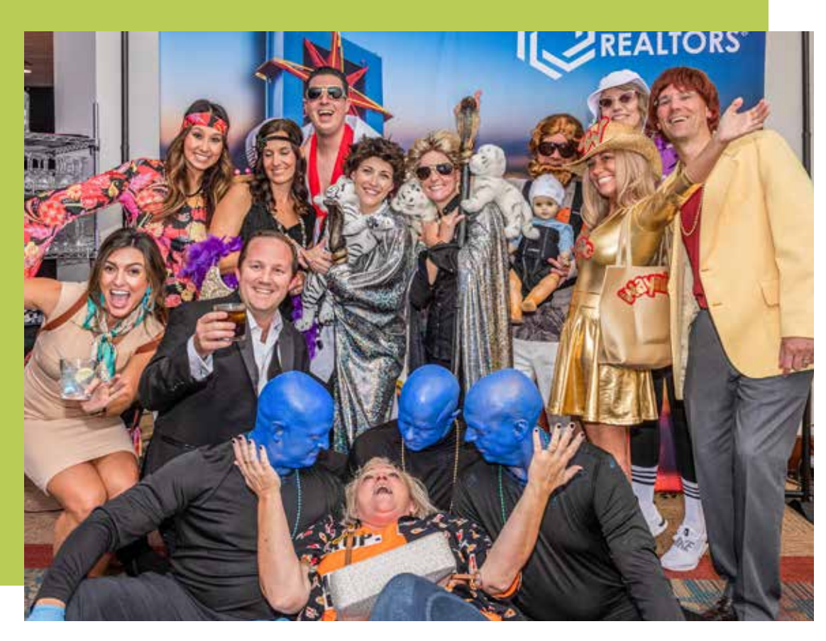
The Casino Fun Night brought many laughs at the Vegas costumes and characters. Attendees enjoyed winning big with their fun money and networking with REALTOR® friends from around the state